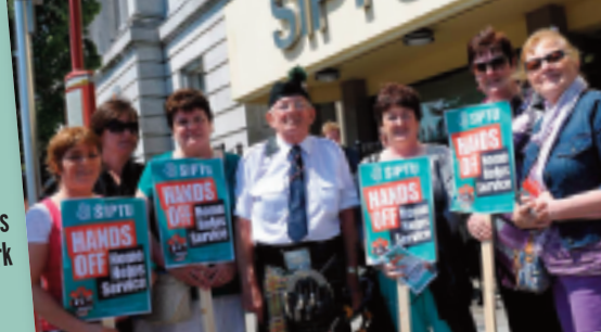
Home Helps protest in Cork