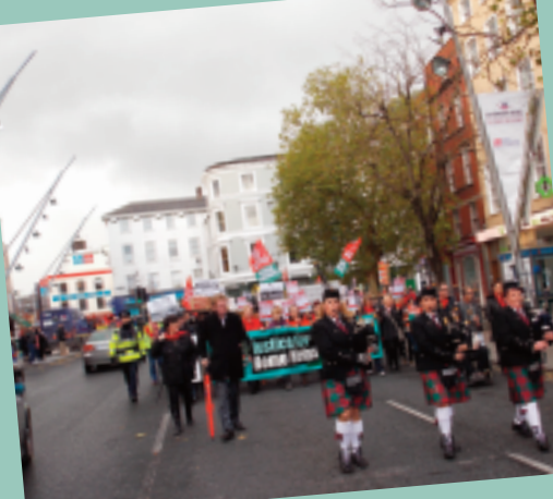
Home Helps Protest in Cork, November 2012