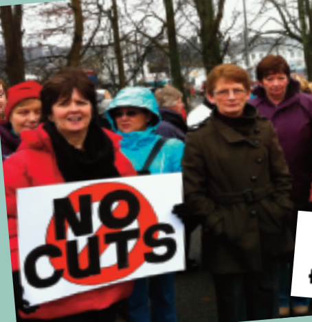
Galway Home Helps on the march